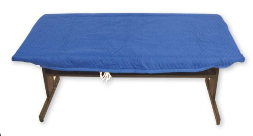
TABLE TOP COVER

Form fitting table top cover offers unparalleled protection. Heavily padded quilted cover is made of a cotton polyester blend for the best combination of durability and softness. Drawstring securely holds cover in place. Overall size 65" L x 51" W x 5" D