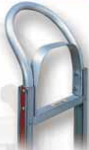
TYPE 12 HANDLE Basic loop handle with "U" brace for extra load support. Model # 12