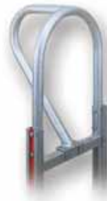
TYPE 15 HANDLE Single vertical loop handle. Model # 15