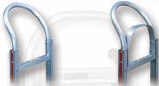
TYPE 11 HANDLE Popular "U" loop handle is ergonomically designed to provide comfort to the wrist and easy operation of the hand truck. Model # 11

RENTAL EQUIPMENT | MOVING EQUIPMENT | FURNITURE PADS | WAREHOUSE EQUIPMENT | APPLIANCE DOLLIES | HAND TRUCKS | VAN EQUIPMENT | CARGO CONTROL | RAMPS/WALKBOARDS | FORMS | LABELS | BOXES | PACKING MATERIALS