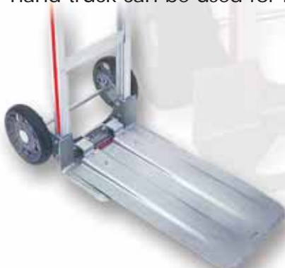
PLATE NOSE EXTENSION

Extensions add extra capacity for handling bulky loads. Extensions retract snugly against frame so hand truck can be used for regular service.