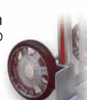
WHEEL #815 8" Mold-on rubber on die-cast magnesium hub with ball bearings. The hard rubber works sell on smooth to semi-smooth surfaces. Model # 815