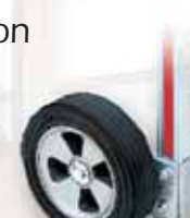
WHEEL #825 8" Solid rubber tire on one-piece polyolefin hub with ball bearings. Model # 825