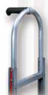
TYPE 17 HANDLE Single pin handle with ergonomic pistol grip for easier leverage. Model # 17