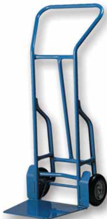
Model # D808B