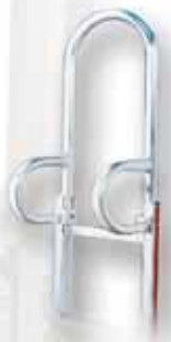
TYPE 35 HANDLE EXTENSION Dual loop handles. Extra tall 55" height. Model # 35