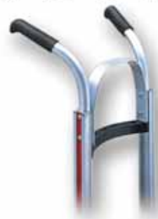
TYPE 16 HANDLE Standard double pistol grip handle. Curved out to meet the operators hands and provide two-handed control. Model # 16