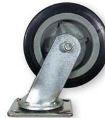
Model # T60

Dual ball bearing rigid caster (Gray) with 6" x 2" compound wheel. 500 lb. capacity