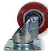
Model # C4HD