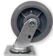
Model # T60-G