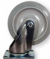
Model # C50