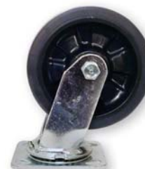
Model # C60