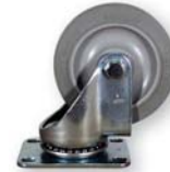
Model # C40