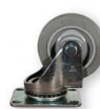
Model # C35

Dual ball bearing rigid caster (Gray) with 6" x 2" wheel. 500 lb. capacity