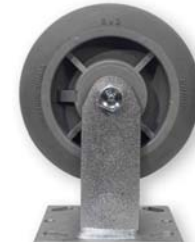
Model # C60R-G